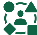
DIVERSITY AND INCLUSION